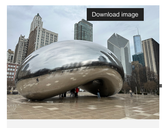
Cloud Gate, Chicago

The use of stainless steel in contemporary art continues growing and evolving as artists explore new lines of expression and push the boundaries of their creativity.