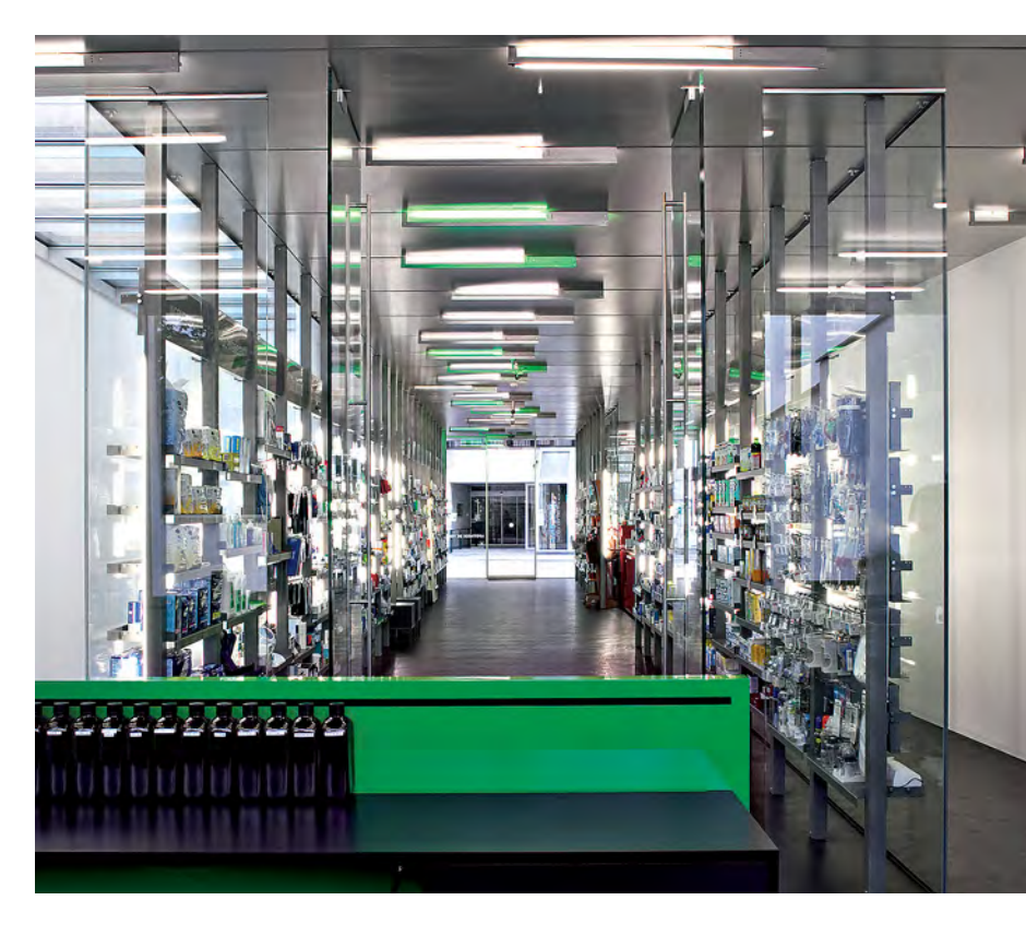
From the counter, the view extends right through the 25-metre glass-walled sales space to the street beyond.

The transparency of the design continues in the open-style flights of stairs, leading down to the private rooms belonging to the pharmacy and up to the three-floor city apartment above the shop. Treads of architectural grating spanned between the stringers of stainless steel sheet (grade: EN 1.4301) and simple flat-steel handrails attached to the wall complete the light, unfussy treatment. As the floors of the long steel frame span across the entire width of the building, no supporting walls are needed. Not only does this facilitate a flexible division of space, leaving options open for later changes in use, it also meant the entire façade could be fully glazed.