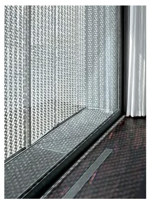
Architectural grating (grade: EN 1.4301) was used for heating vents and for ventilation grilles between the glass panes and the shutters.