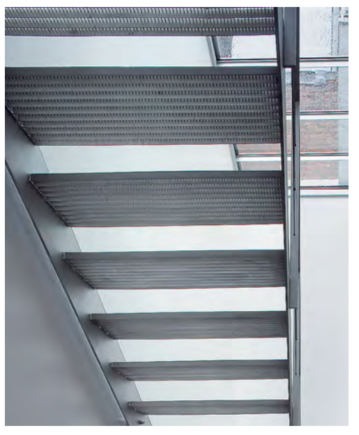
The light, airy style of the interior is continued in the stainless steel handrail profiles and open gridwork treads of the staircases.