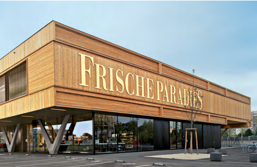
The design of the wooden-clad upper storey is inspired by the euro pallets on which the fresh produce is delivered each day.

The new fresh-food warehouse is visually quite distinct from the utilitarian buildings surrounding it in east Berlin's 'Alter Schlachthof' area, the site of a former abattoir. Its wooden-clad upper storey is like a supersized roof structure, floating above a generously glazed ground floor on V-shaped columns down the long sides.